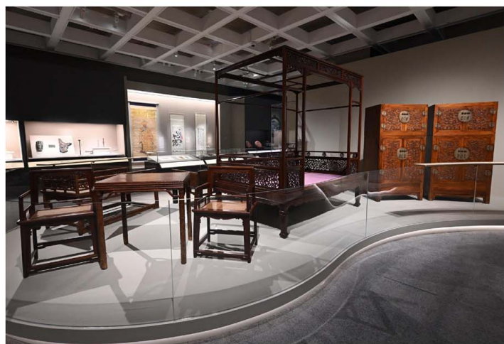
View of the Hong Kong Museum of Art exhibition, “Engaging Past Wisdom: Min Chiu Society at Sixty-five”