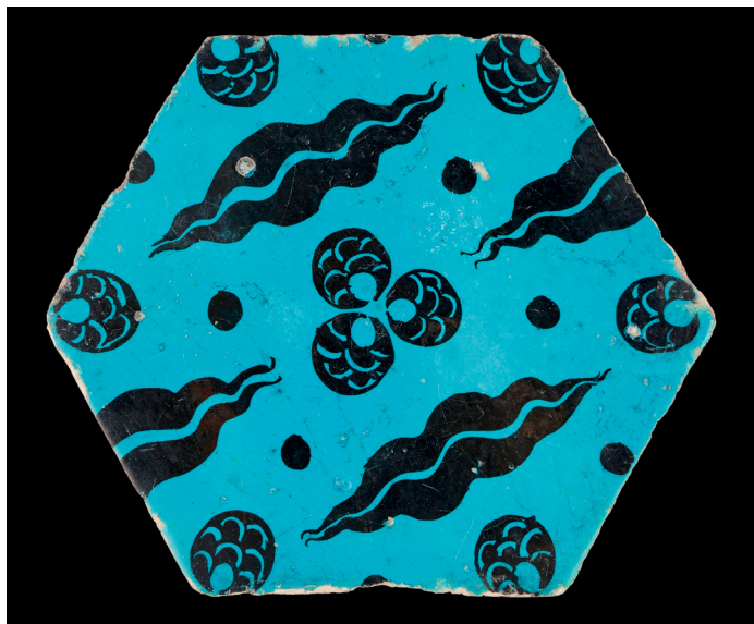
Cintamani tile. Ottoman, 16th century. Ceramic, height 29 cm. ROSEBERRY'S, 12 HAY HILL, W1 (BY APPOINTMENT)