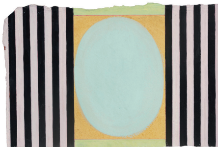
Untitled (P.C. III), by Nicola Durvasula. 2021. Watercolour, gouache and pencil on paper. 20.5 by 30.5 cm. JOOST VAN DEN BERGH, 1 PRINCES PLACE, SW1