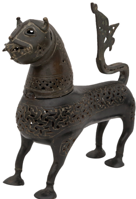
A lion-shaped incense burner. Khorasan, Eastern Iran, 12th century. Cast and open-work bronze, copper alloy, 22.5 by 22.1 by 6 cm. CHISWICK AUCTIONS, BARLEY MOW CENTRE, W4

This year Asian Art in London (AAL) celebrates its twenty-fifth year promoting the arts of Asia. Since its inaugural edition in 1998 the event has grown into a two-week-long event involving more than forty participants. The accompanying events programme has developed to include exhibitions, auctions and talks.