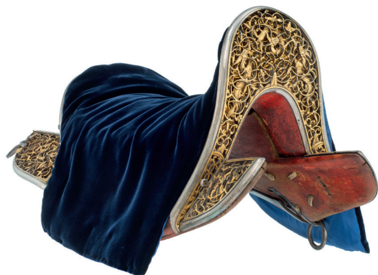
An exceptionally fine saddle. Eastern Tibet or China, 15th–17th century. Iron, silver, gilding, wood and leather, 30 by 56 cm. PETER FINER, 38–39 DUKE STREET, SW1