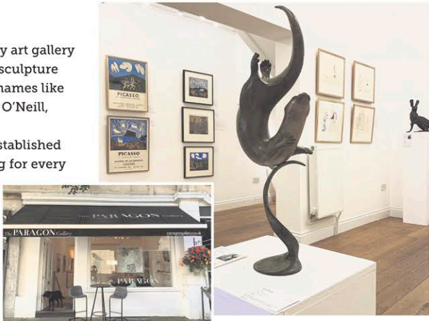
The PARAGON Gallery

Visit paragongallery.co.uk or get in touch at james@paragongallery.co.uk or eleanor@paragongallery.co.uk and call 01242 233391. Visit the gallery at: The Paragon Gallery, 4 Rotunda Terrace, Montpellier Street, Cheltenham, GL50 1SW.