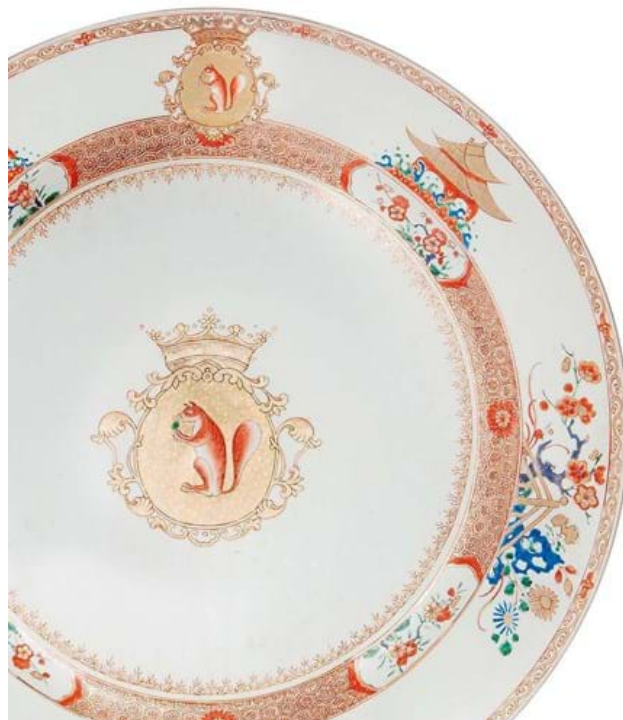
📷 This large 16in (40cm) 'Verte Imari' dish c.1730 is estimated £1500-2000 at Christie's.

The Van Daalen Collection of Chinese Art is being sold by Christie's in two parts: as 15 lots in the sale of Fine Chinese Ceramics and Works of Art on November 5 and as a more diverse online sale with bidding running from October 30-November 6.