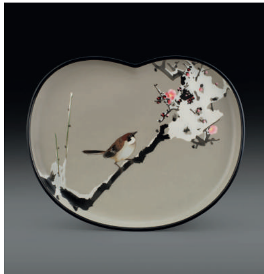
Cloisonné tray with a bird perched on a snow-covered plum tree branch, by Namikawa Sosuke. c.1900. Silver wire and enamel, 29.5 by 24 cm. GRACE TSUMUGI FINE ART, 8 DUKE STREET, SW1