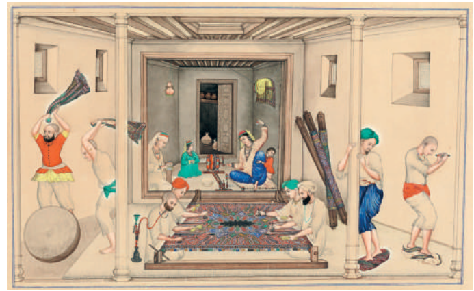
Kashmir shawl weavers. India (Lahore). c.1866. Watercolour and gold on paper. Image: 26.5 by 43.2 cm. SIMON RAY, 21 KING STREET, SW1