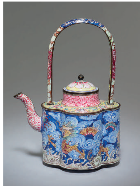
Chinese Canton wine pot. c.1736-95. Enamel, 17.5 by 13 cm. BEN JANSSENS. EXHIBITING AT 15 OLD BOND STREET, W1S

For more information and to download the catalogue, please visit: www.asianartinlondon.com