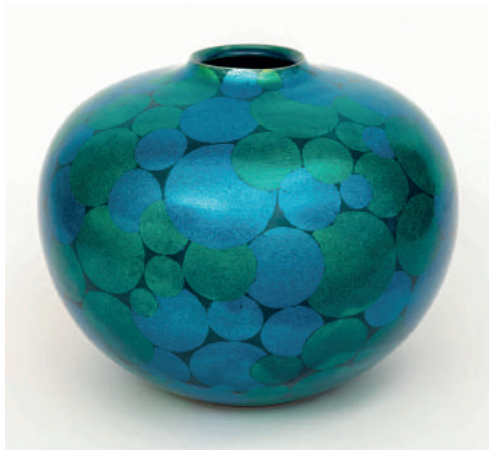
Floral jar, by Ono Hakuko. c.1980. Ceramic with white and gold overglaze, 24.1 by 29 cm. KAI GALLERY. EXHIBITING AT 73 NEW BOND STREET, W1S