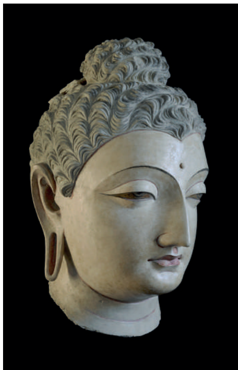
Head of the Buddha. Greater Gandhara region, c.4th-5th century. Stucco with pigments, 61 cm. JOHN ESKENAZI. BY APPOINTMENT (SEE WEBSITE)

THE 22ND STAGING of Asian Art in London will once more assemble forty-six resident and visiting dealers, galleries and auction houses in the capital. Located principally in the gallery districts of Mayfair, St James's and Kensington, a prodigious range of objects dating from antiquity to the present day will be offered for sale. Some specialist dealers will present curated exhibitions with a particular theme, whereas others will mount shows of recent acquisitions. This celebration of Asian art will include works from the Middle East, India, Southeast Asia, Central Asia, China, Japan, Korea and Vietnam.