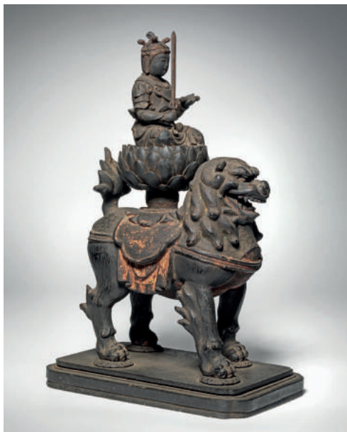
Temple sculpture of Gokei (Five- Topknot) Monju riding a shishi. Japan, 14th–15th century. Wood, 22 cm high. SYDNEY L. MOSS, 12 QUEEN STREET, W1J