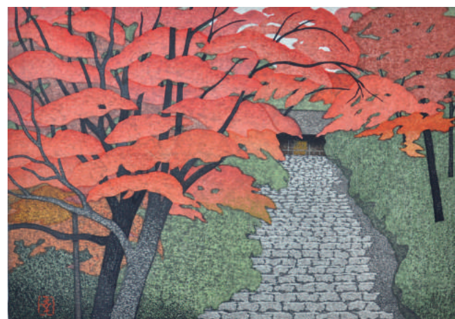
Autumn in Nara (Muro-Ji) , by Kazuyuki Ohtsu. 2011. Woodblock, 170 by 160 cm. HANGA TEN. EXHIBITING AT 8 DUKE STREET, SW1Y