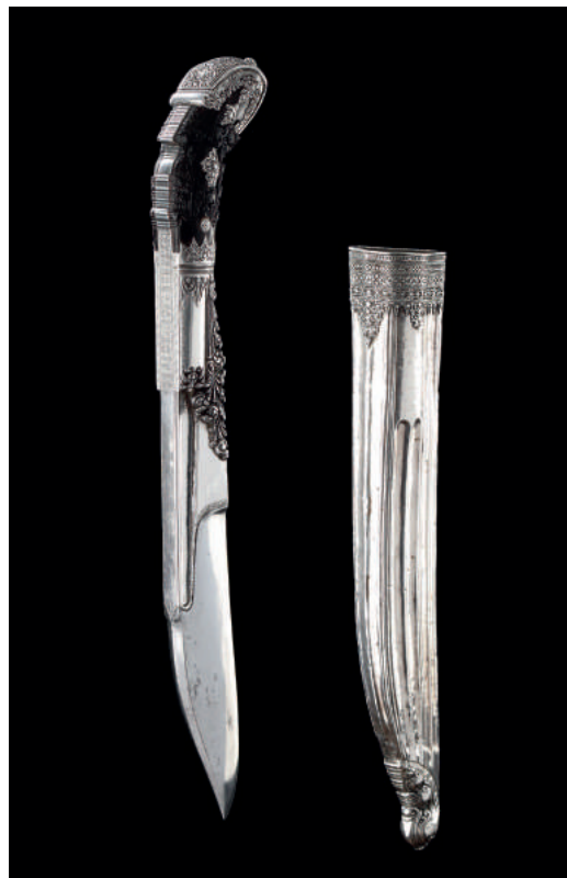
Kandyan dagger and scabbard, Ceylon (Sri Lanka), 18th century. Silver, steel, horn and wood, height 39 cm. RUNJEET SINGH. EXHIBITING AT 6 RYDER STREET, SW1