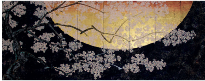
Springtime of life , by Kazuko Shiihashi. Natural mineral pigment on Japanese handmade paper, 90 by 360 cm. KAMAL BAKHSI. BY APPOINTMENT (SEE WEBSITE)