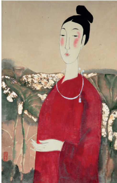
Silvery red spirits, by Vu Thu Hien. 2018. Watercolour on handmade paper, 80 by 55 cm. RAQUELLE AZRAN VIETNAMESE CONTEMPORARY FINE ART. EXHIBITING AT 6 MASON'S YARD, SW1