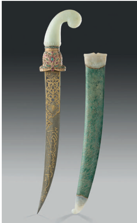
Ottoman dagger, hancer and scabbard. Turkey, 19th century. Steel, rubies, emeralds, sapphire, silver, gold, jade shagreen, glass and wood, 46.5 cm high. PETER FINER, 38-39 DUKE STREET, SW1