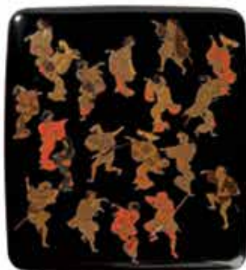
Above: as part of Asian Art in London, Sydney L. Moss, established in 1910, will be exhibiting Japanese lacquer inro and writing boxes, or sizerubako.

上图：成立于1910年的Sydney L. Moss，作为伦敦亚洲艺术的一站，将展出日本漆器印笼和笔筒盒。