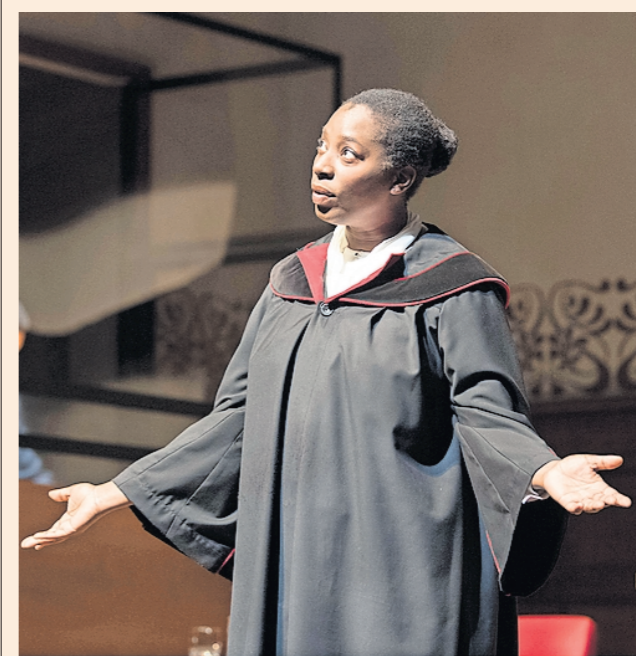
Tanya Moodie as the judge in 'Terror' Alastair Muir