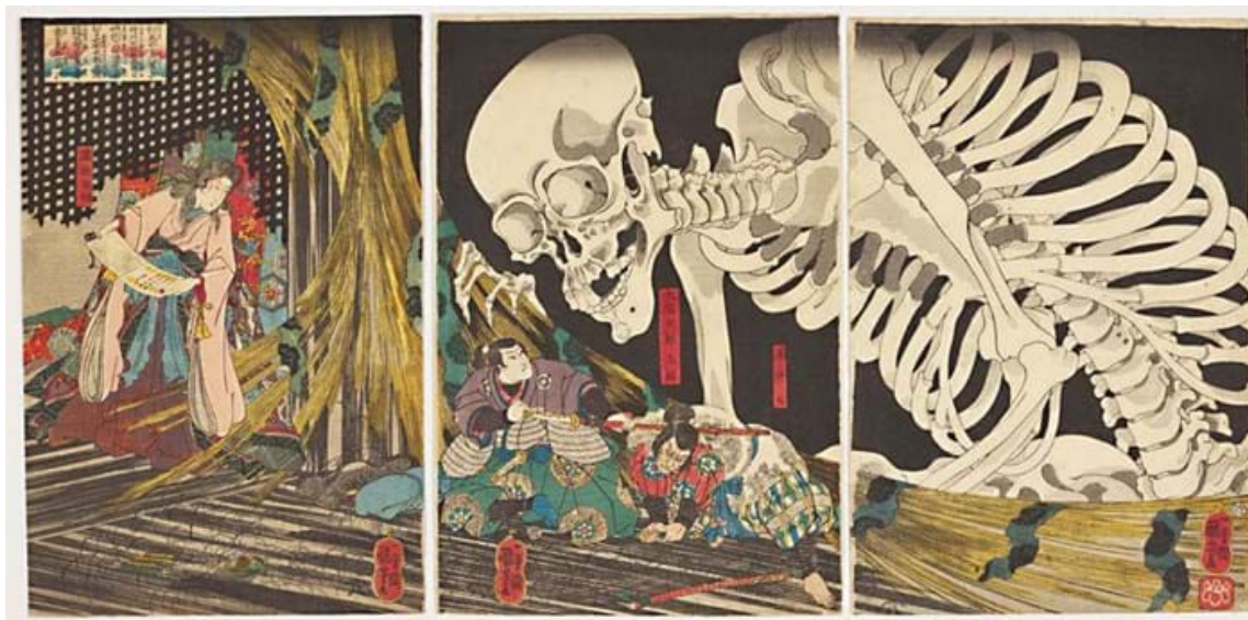
📷 Mitsukuni Defying the Skeleton Spectre Conjured Up By Princess Takiyasha by Utagawa Kuniyoshi – £160,000 at Sotheby's.

The top Japanese work of art sold last week came in a Bonhams sale on November 7 titled Masterpieces of Japanese art from a Royal Collection.