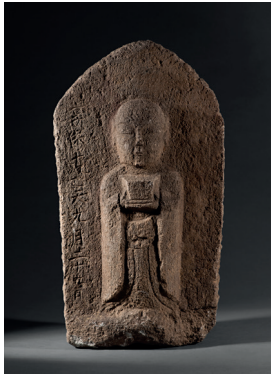
GENROKUART, Rome & Tokyo A rare stone carving of Jizo Bosatsu holding a sutra box Japan, Edo period, Kyōhō era (1716-1736)