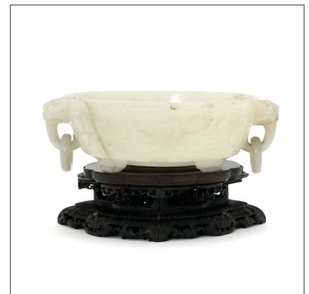
BRUUN RASMUSSEN AUCTIONEERS, Denmark Mutton fat jade bowl, interior with flowers, bats and lingzhi fungus, dragon handles; exterior with Buddhist symbols China, Qianlong (1736-1795) H. 6 cm (2 1/4 in)