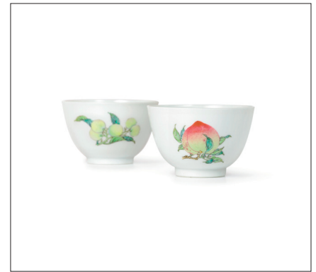
SOTHEBY'S, London A fine pair of Famille Rose 'sanduo' cups China, Yongzheng marks and period