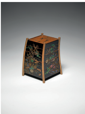
ROSEMARY BANDINI LTD, London Tiered incense box in Somada style lacquer with shell inlays. Toyama, Japan. 19th century