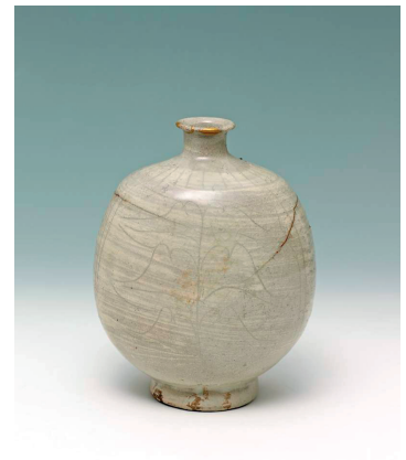
HAN COLLECTION, London White puncheon vase with light floral pattern Korea, 16th century, stone slip-glaze H. 20 cm (8 in) Circum. 47.3 cm (18 1/2 in)