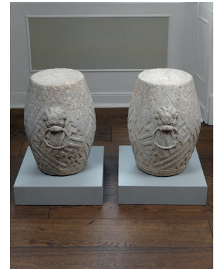
BERWALD, London A pair of garden seats China, late Ming Dynasty (1368-1644) H. 46 cm (18 in)