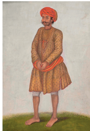
Man in a Red Turban Delhi, c. 1820