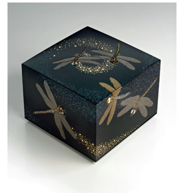
SIMON PILLING, London OKADA, Yuji (b.1948) Ornamental Box ( kobako ), GUNYU , flight Heisei period, 2017 Platinum and gold makie , gold and shell inlays 15 x 15 x 11.5 cm (6 x 6 x 4 1/2 in)