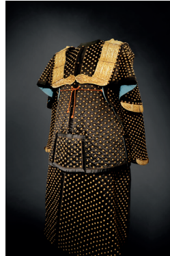
WOOLLEY AND WALLIS, Salisbury, Wiltshire A Chinese blue ground suit of ceremonial armour and helmet of the eight banner troops Qing Dynasty Jacket and skirt: 150 cm approx. (59 in)