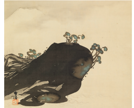
SYDNEY L. MOSS LTD, London Kamisaka Sekka (1866-1942) Painting in ink and colours on silk mounted as hanging scroll depicting a rock and pine, a mountain in the distance in a cloudy mist late 19th-early 20th c.