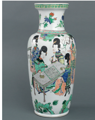
MARCHANT, London Famille Verte 'rouleau' vase painted with scene of elegant ladies of the court China, Kangxi (1662-1722) The pair to this vase is in the Victoria & Albert Museum