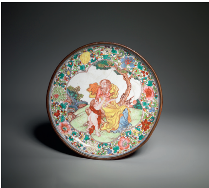
ROGER KEVERNE, London A painted enamel ruby-backed saucer China, 18th century Diam: 11.5 cm (4 1/2 in)