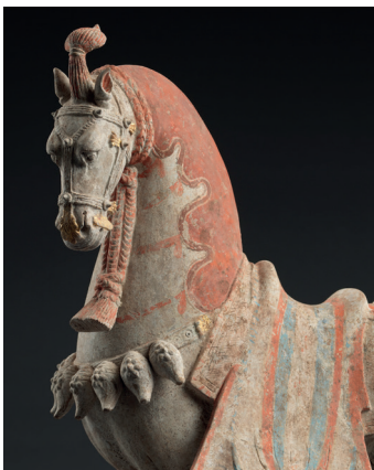
ESKENAZI LTD, London Painted earthenware caparisoned horse (one of two) China, Northern Qi period, 550-577 Height: 63 cm (25 in) From collection of Norman A. Kurland, USA