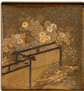
GRACE TSUMUGI FINE ART LTD, London