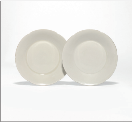
LITTLETON & HENNESSY, London A pair of Ding lobed dishes China, Northern Song Dynasty Diam: 13 cm (5 in)

PRESS IMAGE SHEET - ANTIQUE WORKS OF ART/3