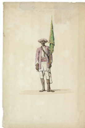
GROSVENOR GALLERY, London One of 10 watercolours showing figures from the Indian army by Thomas (1749-1840) & William (1769-1837) Daniell Pencil, watercolour on paper; assorted sizes