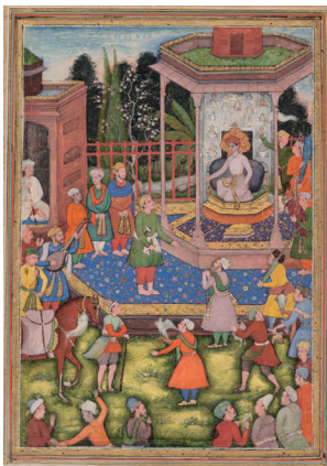
SIMON RAY INDIAN & ISLAMIC WORKS OF ART, London Akbar and his Master Mason India (Mughal), 1600-1610 H. 17.2 cm (6 3/4 in)