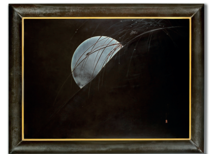
BONHAMS, London Shibata Zeshin (1807-1891) Lacquered wood panel with bell crickets, grasses and full moon Japan, Meiji period (1868-1912) 1877 Image: 44.5 x 62 cm (17 1/2 x 24 3/8 in.) From The Misumi Collection