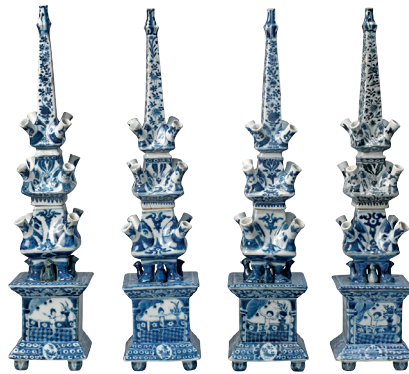
JORGE WELSH WORKS OF ART LTD, London Four porcelain tulip vases decorated in underglaze cobalt blue China, Qing Dynasty Kangxi period (1662-1722) c.1700