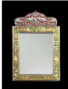
RUNJEET SINGH, London & Warwickshire Thewa mirror, India, partabgarh Rajasthan, 19th century 375 x 245 mm (14 3/4 x 9 1/2 in)