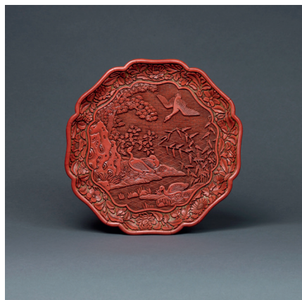
PRIESTLEY & FERRARO, London A carved cinnabar lacquer Wild Geese pattern eight-lobed dish China, 14th century Diam: 30 cm (11 3/4 in)