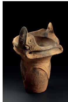
MIKA GALLERY / SHOUUN ORIENTAL ART, New York & Tokyo Pot Middle Jomon period (3,000 - 2,000 BC) Earthenware