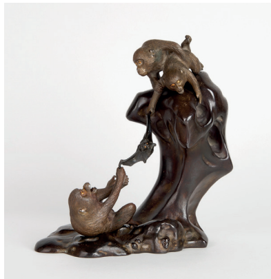
MALCOLM FAIRLEY, London A bronze and shakudo group of monkeys by Oshima Joun, signed on a gilt plaque, c.1900, from AAL exhibition Recent Acquisitions including a collection of spearhead covers.