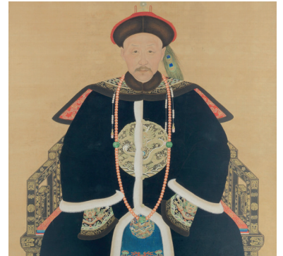
BONHAMS, London (Detail) One of a pair of rare portraits of a Nobleman and Royal Lady, late Qing dynasty, from auction at New Bond Street of Fine Chinese Art , 10 November 2016.