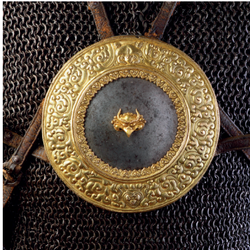
RUNJEET SINGH, Warwickshire, UK

from AAL exhibition Arms and Armour from the East .