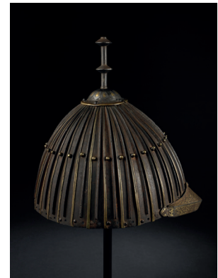
PETER FINER, London An iron multi-plate helmet of 31 lames, Tibet/Mongolia/China, 16th century from AAL exhibition of Islamic and Oriental Arms and Armour .