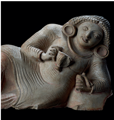
JOHN ESKENAZI, London Reclining male figure Gandhara, 4th/5th century, painted stucco from AAL exhibition of Recent Acquisitions .