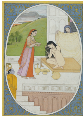
FRANCESCA GALLOWAY, London The Glimpse of Krishna , Illustration to the Bihari-Satsai Series , 1780-1790, one of the Pahari Paintings from the Seitz Collection on view during AAL 2016.