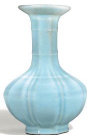
SOTHEBYS, London A rare Ru-type Vase, Qianlong seal mark and period, from auction of Important Chinese Art , 9th November 2016.