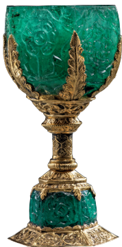
SIMON RAY, London Emerald Wine Cup, India (Mughal) 18th century carved emeralds set with gold mounts dated AH 1300/1882-3 AD from AAL exhibition Indian & Islamic Works of Art .