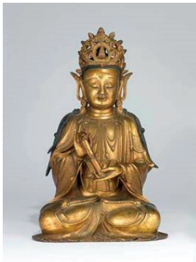
CHRISTIES, King Street, London A rare gilt-bronze figure of Guanyin, 17th century, from auction of Fine Chinese Ceramics & Works of Art , 8th November 2016.