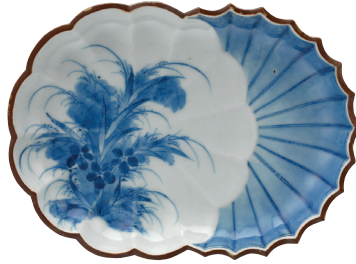
GRACE TSUMUGI FINE ART, London A rare blue and white porcelain dish of double flower form with autumn leaves, Arita Ware, Kakiemon kiln, Japan, 17th century, from AAL exhibition Recent Acquisitions .

from AAL exhibition Arms and Armour from the East .