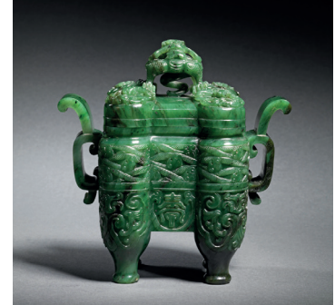
ROGER KEVERNE, London A fine jade incense burner and cover, China, 18th century, from AAL exhibition of Chinese Works of Art .