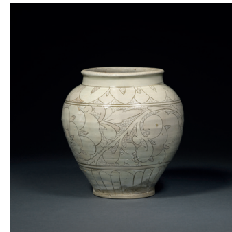
PRIESTLEY & FERRARO, London A Cizhou white-glazed sgraffiato jar, Song dynasty (960-1279) or Jin dynasty (1115-1234) from AAL exhibition Chinese and Korean Ceramics and Works of Art .