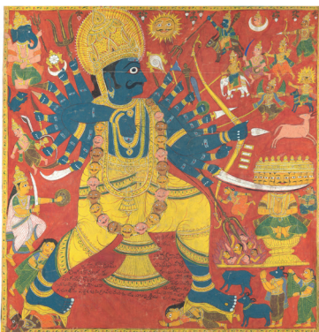
SAM FOGG, London (Detail) A 15 metre painted scroll of the Madel Puranamu , illustrating story of Daksha-Yajna and Virabhadra , Deccan, Telangana, early 20th century, on cloth, opaque pigments, from AAL exhibition A Library of Manuscripts from India .