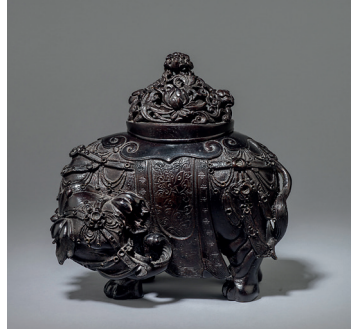
BEN JANSSENS ORIENTAL ART, London Bronze censer in form of an elephant, China, Ming dynasty, 16th-17th century, from AAL exhibition In Scholar's Taste .