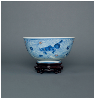
MARCHANT, London A Chinese Imperial porcelain blue and white and underglaze copper-red deep bowl, the interior painted with a carp, 6 character Kangxi mark and of period, 1662-1722, from AAL exhibition Kangxi Blue and White and Underglaze Copper-Red .