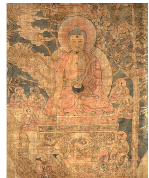
ROSSI & ROSSI, London (Detail) Shākyamuni's Miracles , 14th century, distemper on cotton from AAL exhibition Classical Selection 2016 .