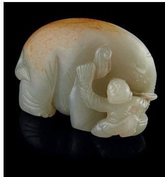
LYON & TURNBULL, Edinburgh A celadon jade figural group of a boy washing an elephant, Qing dynasty, 18th/19th century, from auction at Asia House, London , 8th November 2016