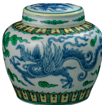
WOOLLEY & WALLIS, Salisbury, Wilts An important Chinese Imperial doucai jar and cover, mark and period of Yongzheng, from auction Asian Art I & II , 15th November 2016.