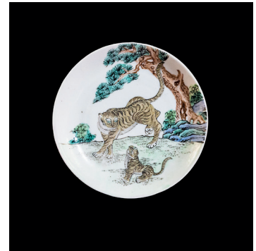
COHEN & COHEN, London A rare Chinese eggshell porcelain ruby back teabowl and saucer (saucer above) with tiger and cub in famille rose enamels, from AAL exhibition TigerTiger