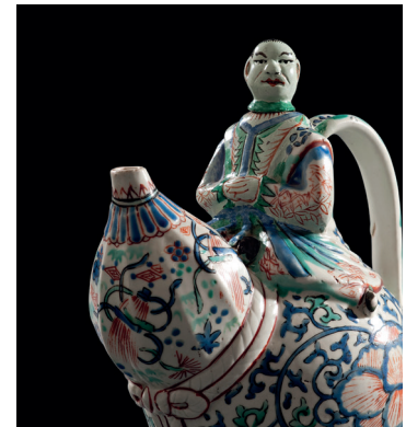
GENROKUART, Rome & Tokyo Rare, early example of porcelain ewer in shape of a European figure seated on a gourd, decorated with overglaze polychrome enamels, Arita, Japan, 1657-1660, from AAL exhibition Four Hundred Years of Japanese Porcelain .