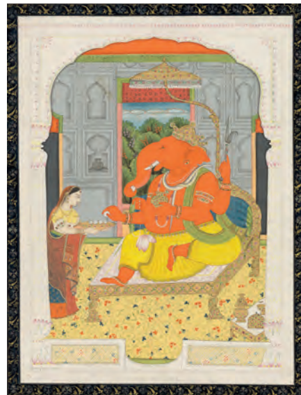
Ganesh enthroned. Attributed to Sanju. India (Mandi). c.1800-20. Watercolour with gold on paper, 30.4 by 23.1 cm. SIMON RAY, 21 KING STREET, SW1