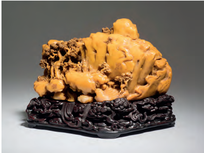
A landscape group. Qing dynasty. 18th-19th century. Soapstone, 14 by 7.5 by 8.5 cm. BEN JANSSENS ORIENTAL ART, 33 ST JAMES'S SQUARE, SW1

For information please visit www.asianartinlondon.com