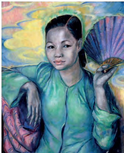
Woman with a fan. Indochina (unsigned). c.1940s. Oil on canvas, 55 by 46 cm. RAQUELLE AZRAN VIETNAMESE CONTEMPORARY FINE ART. EXHIBITING AT: 6 MASON'S YARD, SW1