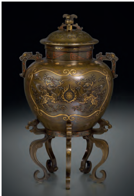
Bronze koro (incense burner), by Mizutani Kitaro. Japan, Meiji period. c.1880. Gold, silver and copper inlay on bronze, 37 cm high. MALCOLM FAIRLEY LTD, 40 BURY STREET, SW1